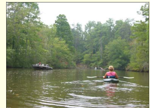
The Dragon Run Swamp offers spectacular and challenging recreational opportunities