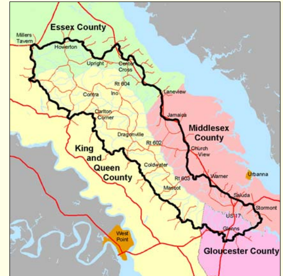
The Dragon Run watershed encompasses 140 square miles of forests, wetlands, and farms