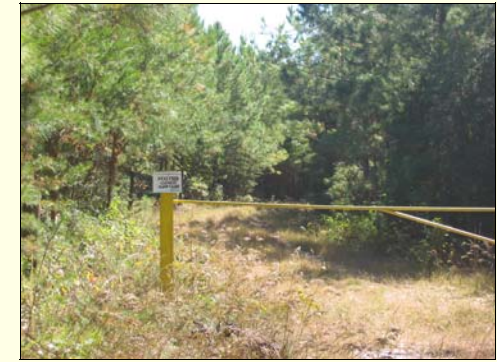
Traditional uses like forestry and hunting work side-by-side to fuel the watershed's economy

Monitor Watershed Management Plan Implementation