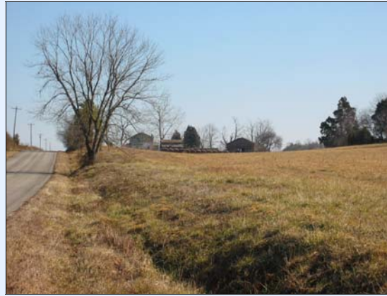
A picturesque rural landscape contributes to a high quality of life in the watershed