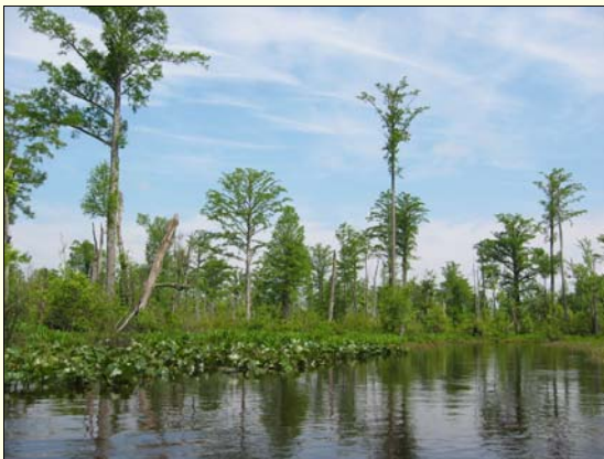
Extensive bald cypress and aquatic vegetation make the Dragon Run Swamp unique in the Chesapeake Bay watershed

The Dragon Run Special Area Management Program, a partnership between the Virginia Coastal Program and the Dragon Run Steering Committee, is designed to gather stakeholders to plan for the watershed's future. Substantial common ground defines the community's vision for proactively preserving the Dragon Run for future generations and safeguarding both natural resources and traditional uses, including landowners' property rights.