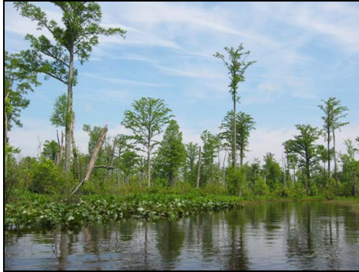
Majestic baldcypress trees along the Dragon Run

Section 7 itemizes the resources needed to implement the actions in the watershed management plan. This section also identifies responsible parties and possible funding sources.