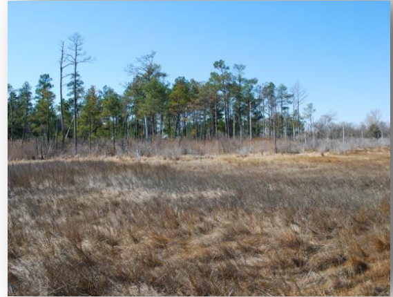
Marsh regression into an adjacent low-lying pine forest on the York River.

The Middle Peninsula is rich in gently sloping, low elevation uplands and wetlands immediately adjacent to or in close proximity to tidal waters. Lands exhibiting these characteristics are at risk to increased frequency of high-tide flooding and gradual inundation from rising sea levels. Within the Middle Peninsula, vulnerable lands include but are not limited to New Point Comfort, Bohannon, Retz, Onemo, Diggs, Roane, Heart Quake Trail area, Deltaville, Locklies, West Point, Romancoke, Winona Park Road, Pamunkey Tribe Reservation, Ware Neck, Nexara, Guinea, Purtan Bay, Catlett Islands, Tappahannock, Gynnfield Subdivision, Lower Essex, Kendall Road, and Layton Peninsula (MPPDC, 2010).