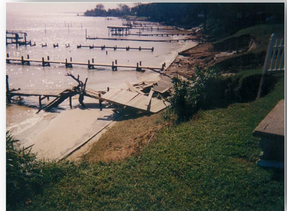
Storm damage incurred on the York River during Hurricane Isabel, 2003.

• Increased Storm Damage. Elevated sea levels will intensify storm impacts due to increases in damaging wave energy and risks of severe flooding further inland. Comparisons between two locally relevant storms whose storm surges peaked near high tide illustrate the impact of sea level rise on coastal flooding. The more powerful 1933 hurricane produced a storm surge 1.0 ft (0.3 m) greater than Hurricane Isabel in 2003, yet the high water mark or storm tide elevation (sum of storm surge and astronomical tide), was comparable to Hurricane Isabel's 7.9 ft (2.4 m) above mean lower low water. A rise in sea level over the 70 year period between storms, on the order of 1.0 ft (30 cm), is attributed to allowing the weaker storm to produce an equivalent storm tide (Boon 2005). In light of rising sea levels, significant property and infrastructure damage from erosion, wave action and flooding is likely to occur from severe storm events such as hurricanes and nor'easters, as well as less powerful storm systems.