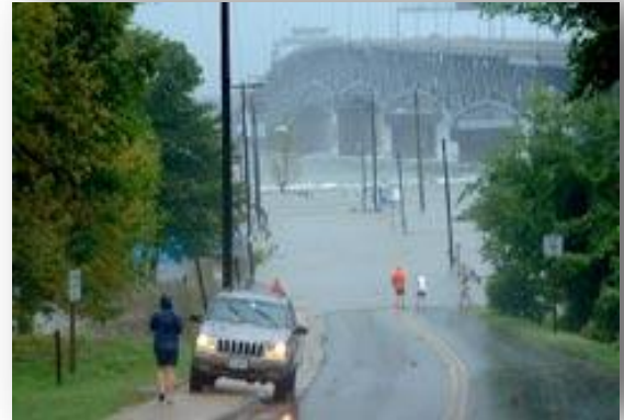
Coastal flooding at Gloucester Point during Hurricane Isabel, 2003.

Processes responsible for rising sea levels are complex. To help simplify the matter, it is useful to make a distinction between the concepts of eustatic and relative sea level (RSL) change. Eustatic change, which can vary over large spatial scales, describes sea level changes at the oceanic to global scale that result from changes in the volume of seawater or the ocean basins themselves. The two major processes responsible for eustatic change are the thermal expansion of seawater due to warming and the melting and discharge of continental ice (i.e., glaciers and ice sheets) into the oceans. The global average for current (2003-mid 2011) eustatic sea level change is 0.11 in/yr (2.8 mm/yr) (NOAA Laboratory for Satellite Altimetry) with estimates for the Chesapeake Bay region on the order of 0.07 in/yr (1.8 mm/yr; Boon et al. 2010) for the approximate same time period.